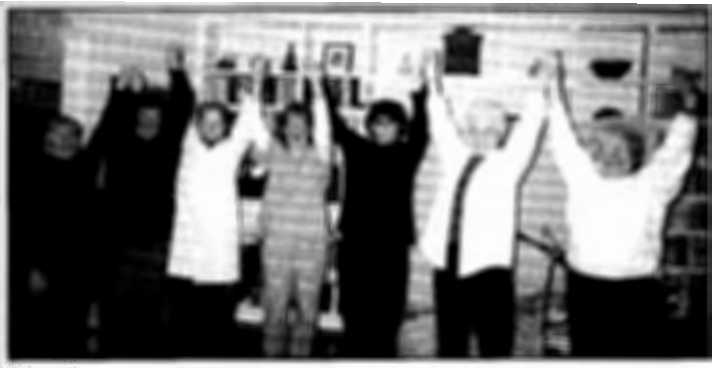
A Successful Performance.

In creating programs for the next twelve months, we have continued to be guided by the overarching theme of the conference, "Human Suffering," with a focus on clinical applications. In December, we mounted a semi-staged presentation of the current Broadway play Wit , with all the parts interpreted by our members. This is a play about an intellectually disciplined, emotionally stunted woman in the final stages of cancer. Her final moments of life recapitulate her defining experiences and permit her to grow beyond them.