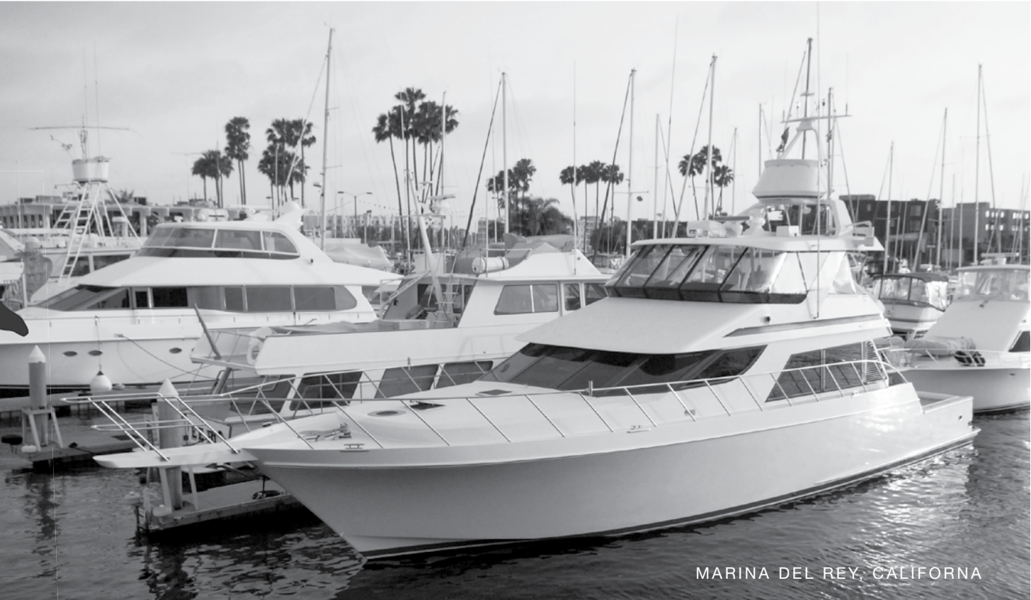
MARINA DEL REY, CALIFORNIA